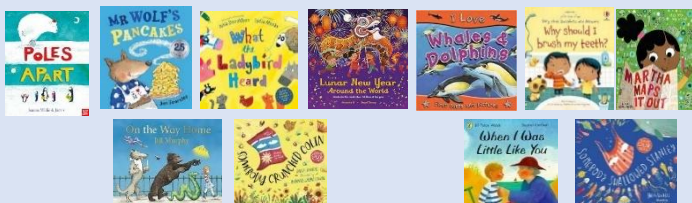
Poems this term – A Carrot Nose, Pancakes and A Little House

We have focused text sessions and poems throughout the year that link to the children's learning. Last term we shared QR codes of some of these texts and we will continue to do the same this term. This term we will be exploring the following fiction and non-fiction texts: